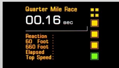
Countdown on traffic lights