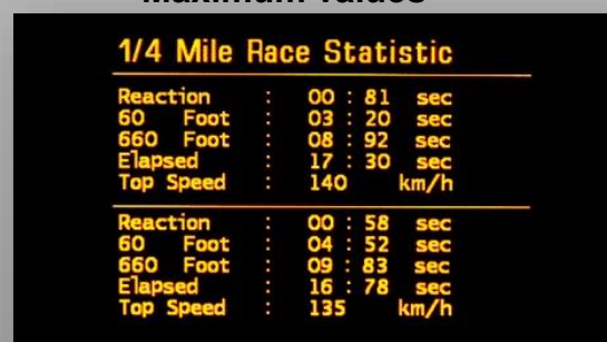
Quarter mile- Maximum values