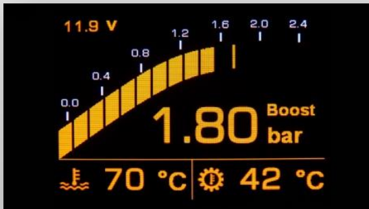
Boost pressure display