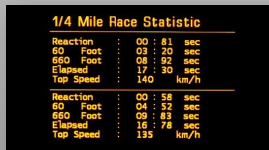
Quarter mile- Maximum values