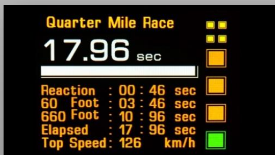
Quarter mile - Display