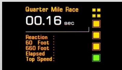
Countdown on traffic lights