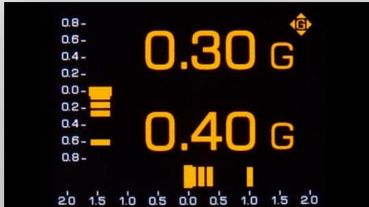
Lateral and Longitudinal acceleration